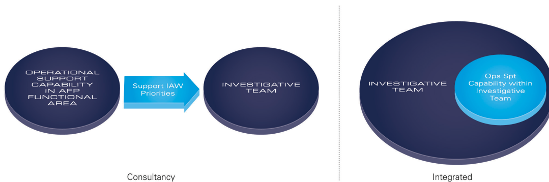
Fig 6-1. Consultancy and Integrated Models of Operations Support to an Investigation

Specialist roles are usually filled by a specialist member from that function (e.g. the High Tech Crime Operations (HTCO) coordinator is a full time member of HTCO). Specialist support areas would be co-opted as an as needs basis during the investigation. Investigators should engage with the requisite specialists early in the investigation.